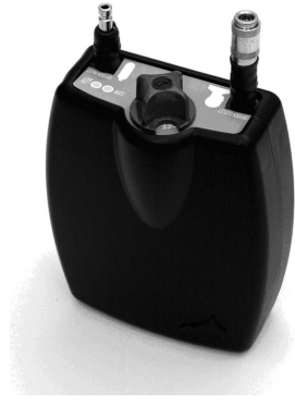
FIG. 2. Pulse dose meter of the Summit Oxygen PD110 nasal demand system. The device detects a negative pressure during inspiration and delivers a fixed pulse of oxygen.

oxygen saturation ( Sa_{O_2} ) via an ear-clip oximeter. The apnea/hypopnea index (AHI) is a record of the number of apneas and hypopneas occurring during each hour of monitoring. For this study, an apnea was defined as a tidal volume less than 25% of the running baseline for at least 10 sec; a hypopnea was defined as a tidal volume of less than 50%, but greater than 25% of the running baseline for a similar period of time (AASM Task Force Report, 1999).